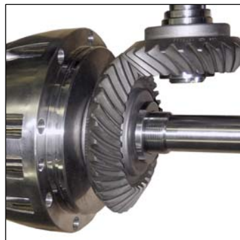
Precision Match Ground Spiral Bevel Gears