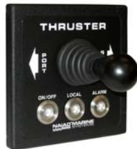
Spring Centered or Put & Stay

Single-stage or fully variable (proportional) controls. Proportional configuration permits the output of the thruster to be throttled by the operator and features a PLC (Programmable Logic Controller) specifically programmed for the application. Controls are housed in a single, durable enclosure for ease of installation. Easily fitted with numerous joystick controls. Most Naiad thrusters are powered by a Naiad Integrated Hydraulic System (IHS). The PLC is easily configured to control many ancillary hydraulic shipboard systems.