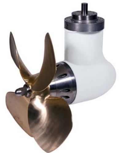
Four Blade Kaplan Style Propeller